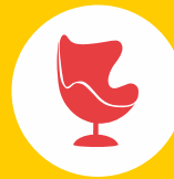
Hotel & Restaurant